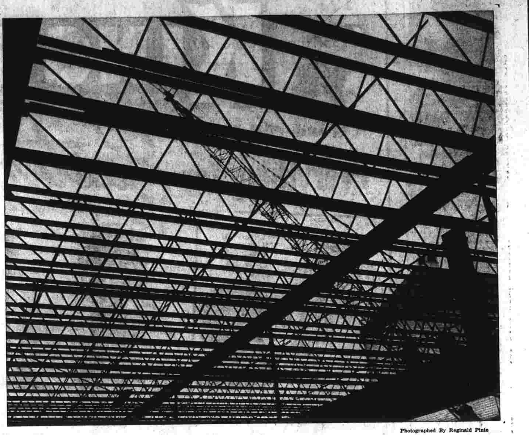
EDUCATIONAL FUNDAMENTALS: Floor At St. Bridget's School

At any time in history, some men go wrong. But when the prevailing intellectual climate is that "wishing can make it so," you can expect quite a few men to go wrong. — THE NATIONAL OBSERVER